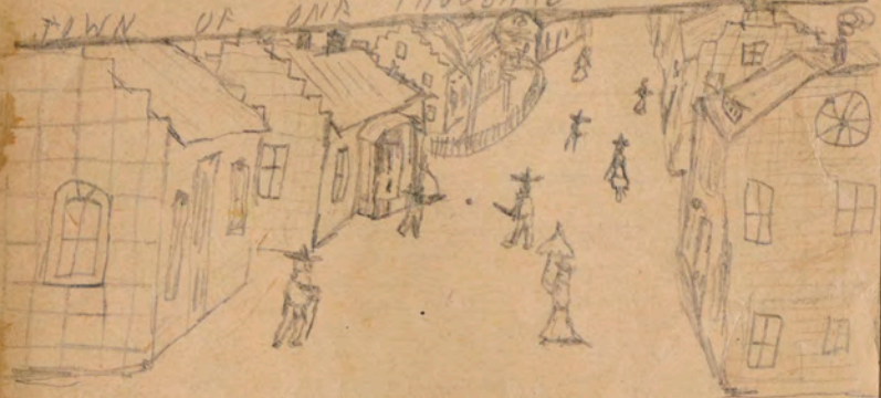
SCENE IN COLONY CITY. MAIN ST. 1608

USED TO THE CLIMATE VERMIGO AND FIFTY OF HIS MEN WENT EXPLORING INTO THE CENTER OF THE CONTINENT HERE THEY FOUND NEAR A RIVER A FINE FLAT FERTILE COUNTRY WHICH THEY SOON BROUGHT THE REST OF THE COLONY TO AND SOON HAD A LARGE TOWN OF ONE THOUSAND INHABITANTS