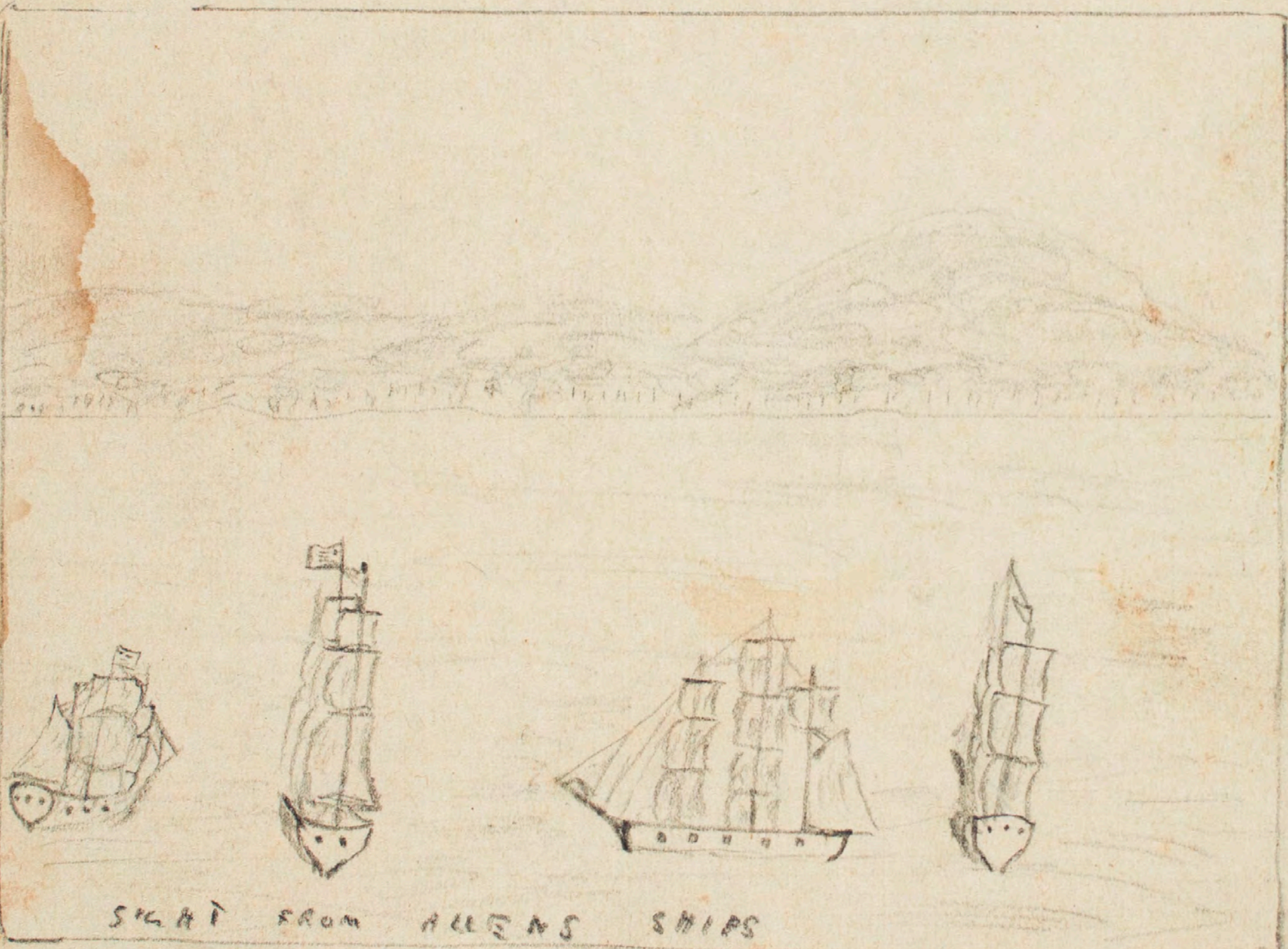
SIGHT FROM ALLEN'S SHIPS

NEW POPLINGTON AFTER THE WIDERNESS OF POPLINGTON ON THE CONTINENT ETHAN ALLEN STARTED WITH 4 SHIPS AND 4 HUNDRED MEN WOMEN AND CHILDREN FOR NEW POPLINGTON MAY 8TH 1669 THEY HAD A SPLENDID TRIP AND WITH IN A MONTH THE LARGE SCRAGLY TOPS OF THE HUGE POPLERS AND THE TALL STAGELY MOUNTAIN IN THE BACK GROUND WHICH IS CALLED NOW ROUND MOUNTAIN