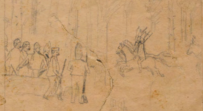
THERE WAS TRAIL IN THE FOREST

AT THE TIME WHEN A LITTLE CITY AND SEVERAL THOUSAND IN HABITANT ROCK BURN DID NOT HAVE A SINGLE INHABITANT ONLY IN THE SUMMER WHEN THERE WAS A SMALL PART OF THE YEAR THEN I GOT A FEW WHALE FISHER WHO WERE ON ITS BANKS A LONG WAY BEFORE RETURNING HOME WITH THEIR LOADS BUT AT THE TIME I AM TO SPEAK MY FRIEND BOAT WAGON AND I HAVE BEEN THERE