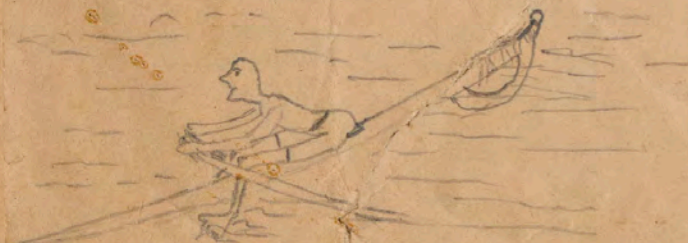
THE NEW RACERS

LAST SATURDAY THERE WAS GREAT EXCITEMENT AT THE NORFOLK NAVY YARD DAIN FORTH NAVY YARD AND THE LITTLE CITY BOAT BUILDING CLUB OVER THE NEW BILL BROUGHT IN TO BE READ BY THE GOVERNMENTS OF THE BIG AND LONG CONTINENT THE BILL WAS THAT THEY SHOULD PAY THE LONG AND BIG CONTINENT NAVY YARDS AND BOAT BUILDING CLUBS 40,000 DOLLARS FOR THE SUPPORT OF THE TWO GREAT AND WONDERFUL BOATS THE CITY OF DUNKIRK AND VIXEN AT EVENING WHEN IT WAS FOUND THAT THE BOAT BUILDERS REVENUE WAS PASSED THERE WAS GREAT CELEBRATIONS CHEER AFTER CHEER RAN ALONG THE DOCKS AND WHARVES AND ALL THE SIX BOATS FIRED THEIR GUNS AND RUN UP COLORED LIGHTS WHILE THE PATRIOTIC FISHERMEN ALONG THE SHORE BUILT UP BONFIRES AND FIRED GUNS THIS BILL WILL PROBABLY TURN OUT GREAT THINGS FOR THE BOAT BUILDERS