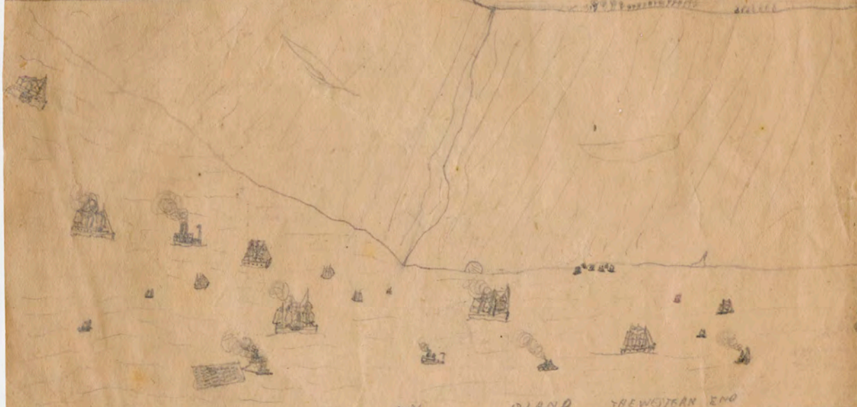
OVAL ISLAND THE WESTERN END

OVAL ISLAND IS SITUATED EAST OF CAPE COLONY IN THE BLACK OCEAN AB OUT FIVE MILES IN THE NEAREST PLACE FROM THE MAIN LAND OVAL ISLAND IS THREE HUNDRED MILES LONG AND 150 MILES WIDE IN THE WIDEST PLACE IT HAS THREE QUITE LARGE LAKES IN THE INTERIOR OF THE ISLAND. HIGHLAND