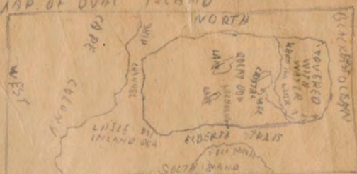
IT IS A VERY PICTURESQUE ISLAND

WHITE SANDS OF THE FISHING SMACKS FLUTTING AROUND AT THE FOOT OF THE HILL IS A COMMON SIGHT HERE IS A MAP OF OVAL ISLAND