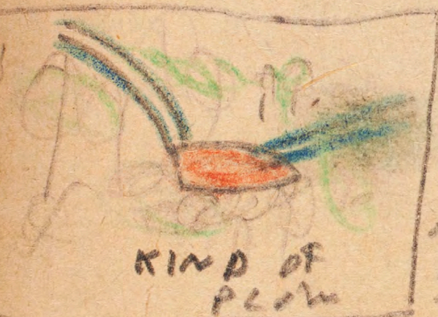
KIND OF PLOW

IN THE SIXTEEN 16 CENTURY WHEN THE BLACK ARCHANGEL D. FOLKS WERE PEOPLING BIG CONTINENT A LOT OF SHIPS LOST THEIR WAY AND CAME ON TO LONG AND ROUND D. CONTINENT HEAR T WAS QUITE FERTILE AND NICE