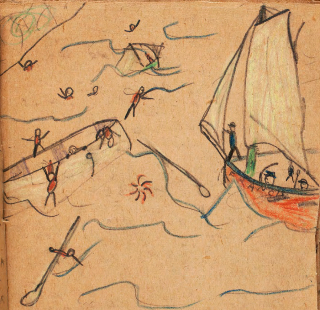
THE BATTLE WITH THE LONG LONG BOAT