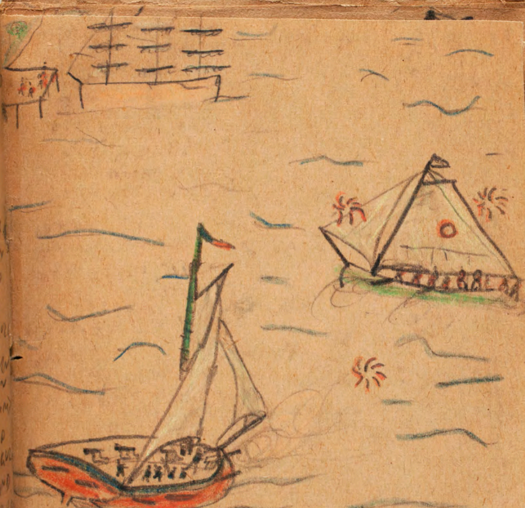
THE BATTLE WITH THE SEACULL