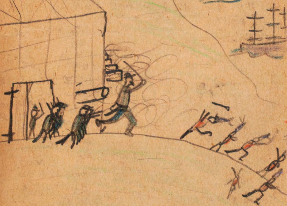
BATTLE OF GRANUTE FORT