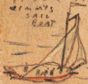
JIMMYS SAIL BOAT

RIGGED UP FOR HE WAS GOING TO ATAK ROCK ISLAND AND EATHAN