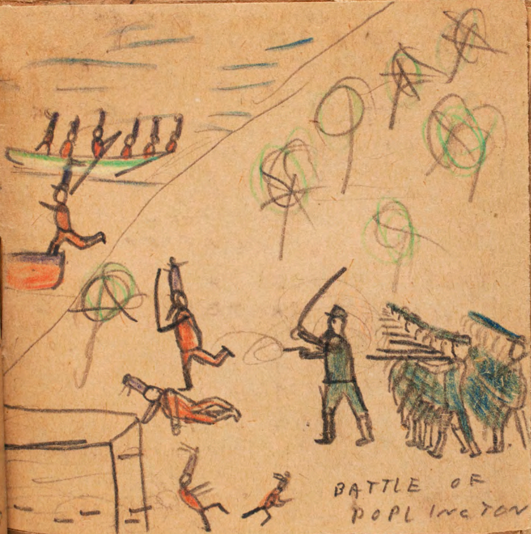
BATTLE OF POPLINGTON